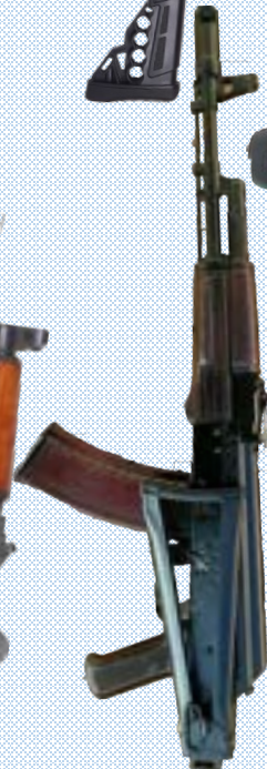
.222 Folding Butt NPB Rifle