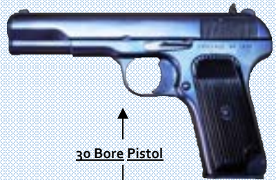
30 Bore Pistol