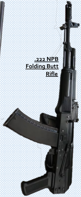
.222 NPB Folding Butt Rifle