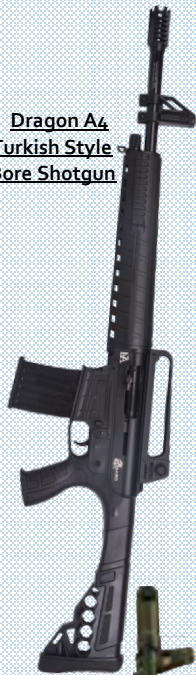
Dragon A4 Turkish Style 12 Bore Shotgun