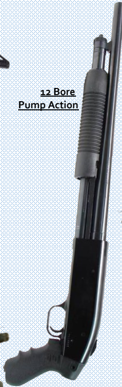
12 Bore Pump Action