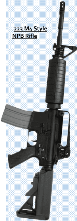
.223 M4 Style NPB Rifle